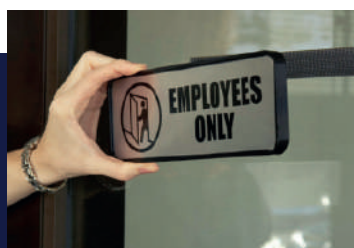
Secure plastic signs to window glass.