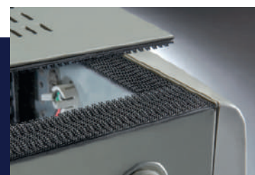
Attach access panels to industrial equipment.