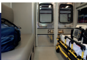
Attach ambulance or bus cushion panels.

On the overleaf there is just a small selection of our 3M™ Dual Lock™ Reclosable Fasteners. We offer many more products within this range. If you have a requirement you would like to discuss please contact your Area Sales Manager or nearest branch.