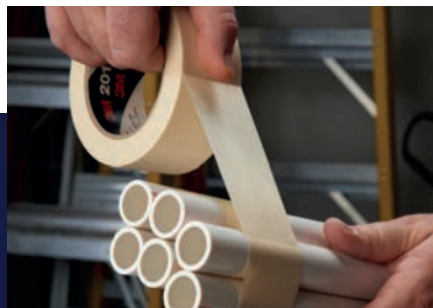
Quickly bundle parts.