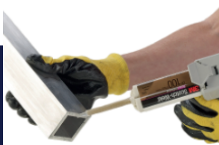
Strong chemistry for durable bonds.