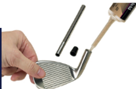
High impact resistance for strong durable bonds.

On the overleaf there is just a small selection of our 3M™ EPX Adhesives. We offer many more products within this range. If you have a requirement you would like to discuss please contact your Area Sales Manager or nearest branch.