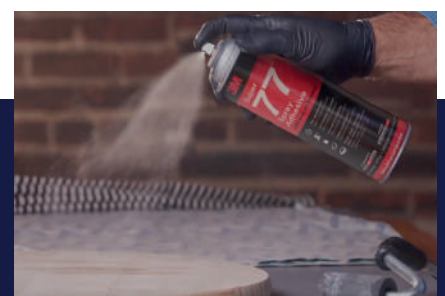
Multi-purpose spray adhesive.