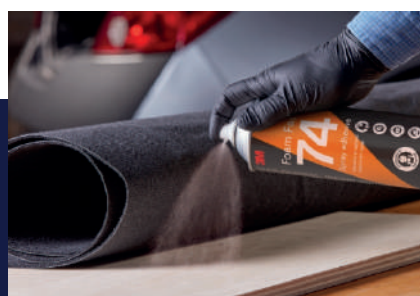
Foam fast spray adhesive.