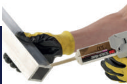
Strong chemistry for durable bonds.