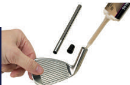
High impact resistance for strong durable bonds.

On the overleaf there is just a small selection of our Two-Part High Strength Adhesives. We offer many more products within this range. If you have a requirement you would like to discuss please contact your Area Sales Manager or nearest branch.